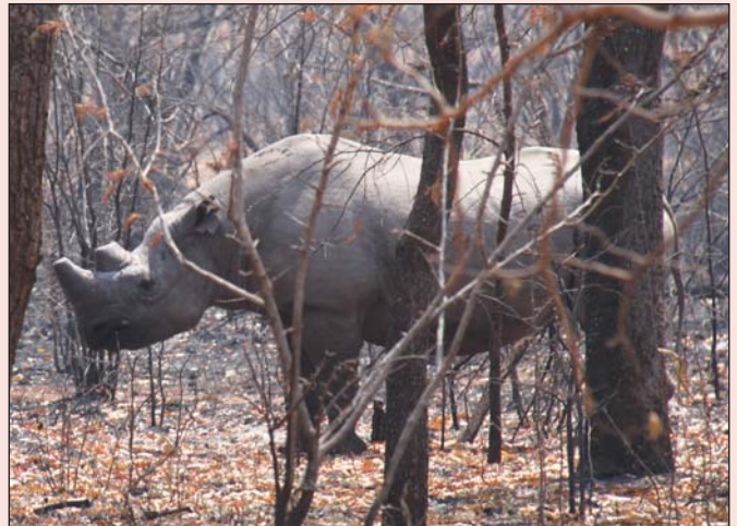
Tsaka 9 yr old male