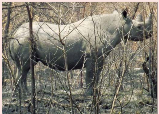
Ronda 5 yr old female