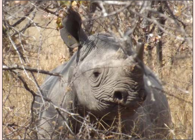
Tendai 9 yr old female